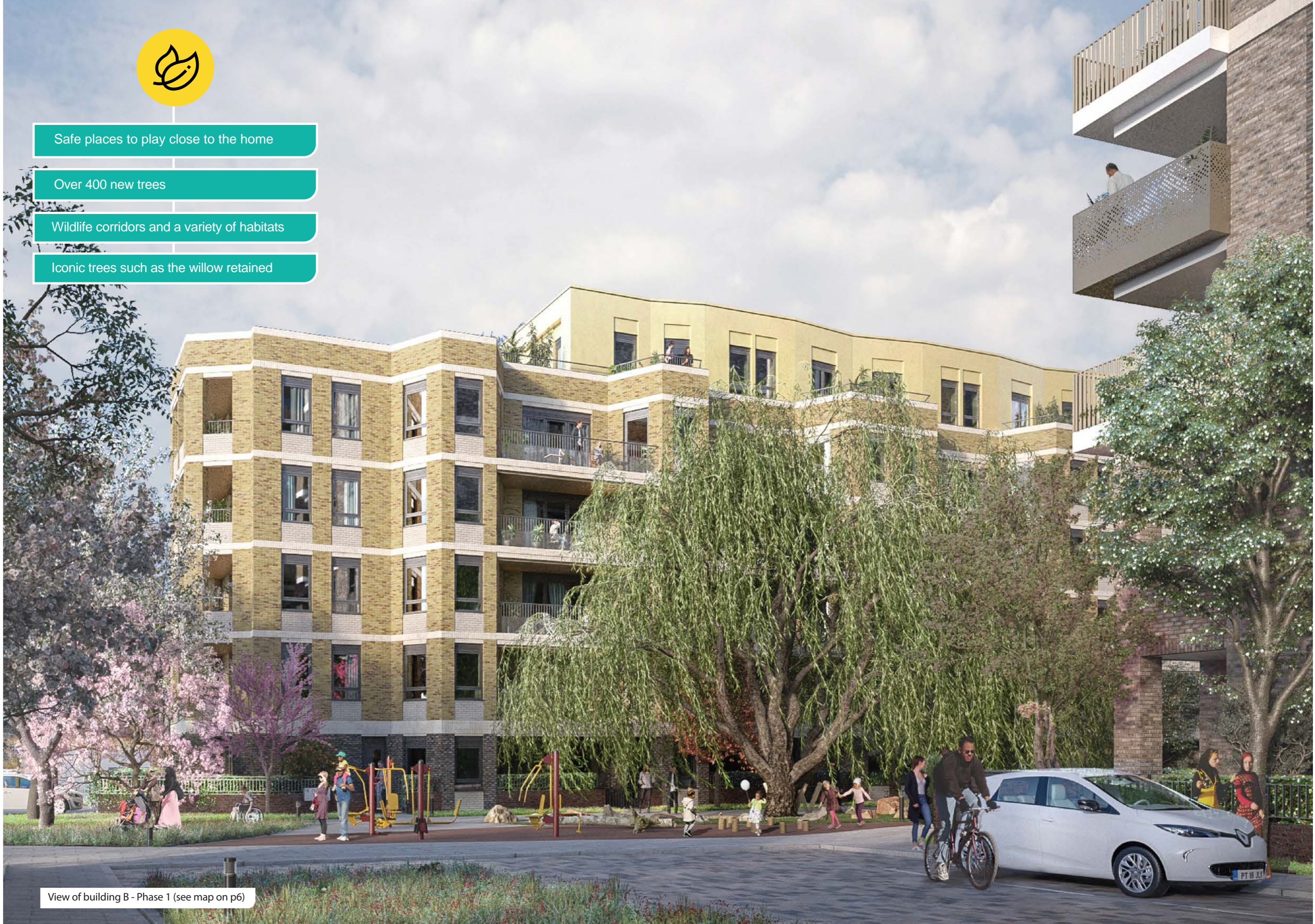
View of building B - Phase 1 (see map on p6)

Iconic trees such as the willow retained