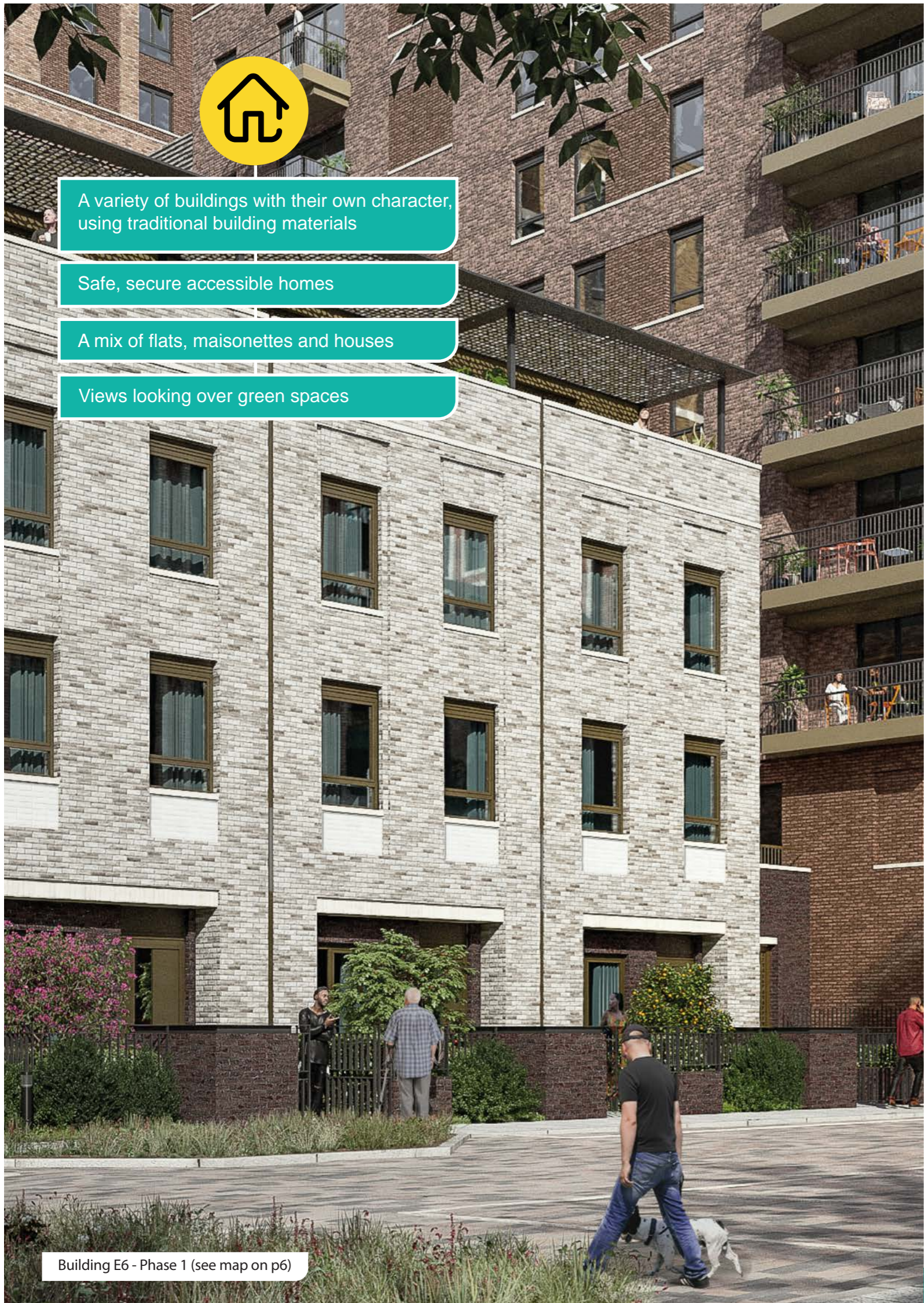
Building E6 - Phase 1 (see map on p6)